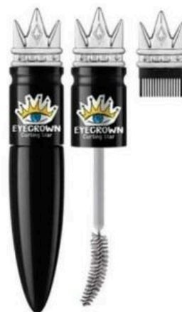
Makeheal EYE CROWN 144/CT