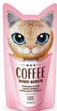
Chok chok BODY SCRUB