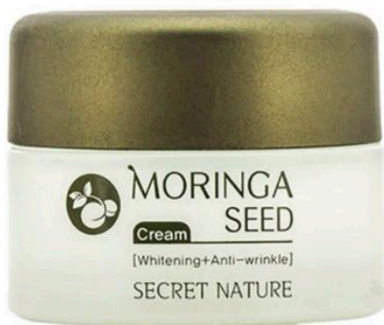
Secret nature MORINGA SEED CREAM