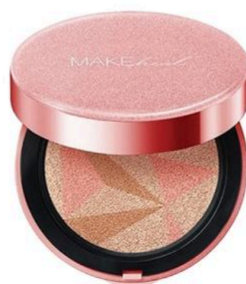
Makeheal EYE PALETTE