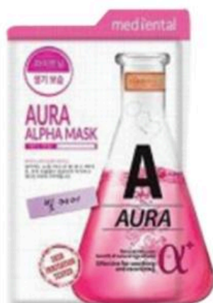
Mediental AURA ALPHA MASK PACK