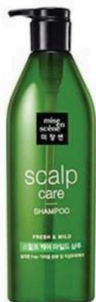
Mise en scene SHAMPOO