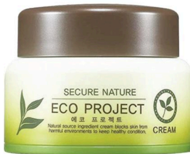
Secure nature ECO PROJECT CREAM