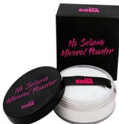
I am soda NO SEBUM MINERAL POWDER