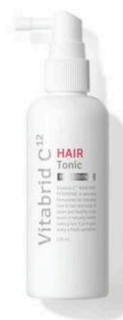
Vitabrid HAIR TONIC