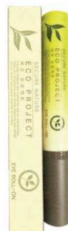
Secure nature ECO PROJECT EYE ROLL