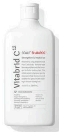
Vitabrid SCALP SHAMPOO