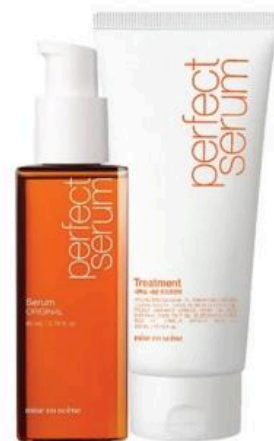
Mise en scene PERFECT SERUM