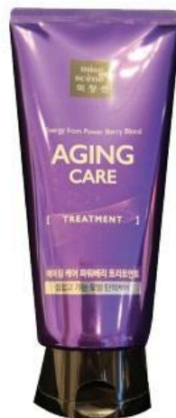
Mise en scene SCALP TREATMENT