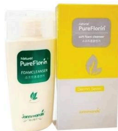
Pure florin SOFT FOAM CLEANSER 128/CT