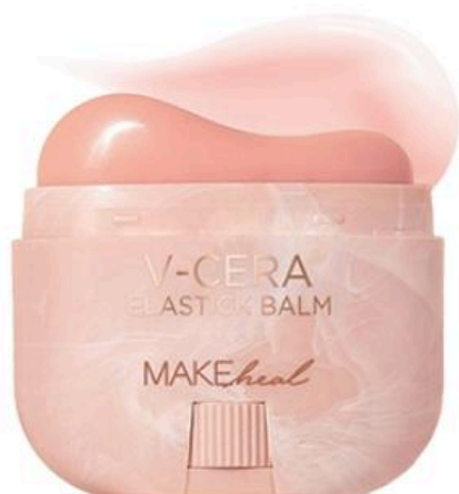
Makeheal V-CERA COVER STICK