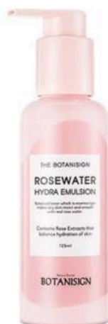
The botanist ROSE WATER HYDRA EMULSION