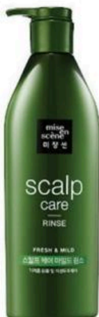
Mise en scene CONDITIONER