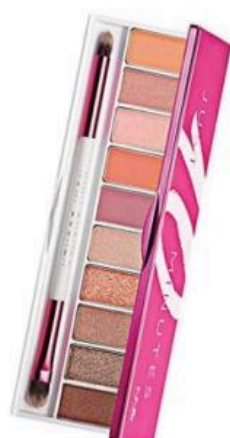
Nuni busher EYE SHADOW GLITTER