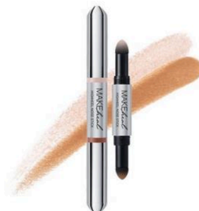
Makeheal NOSE STICK 180/CT