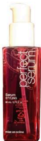
Mise en scene SERUM STYLING