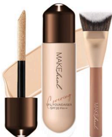
Makeheal I.P.L. FOUNDAISER AMPOULE GLOW