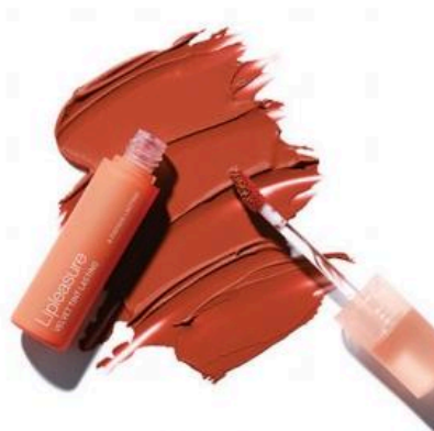
Makeheal LIPLEASURE WATER TINT GLASS